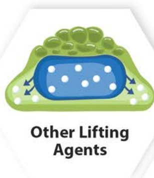
Other Lifting Agents